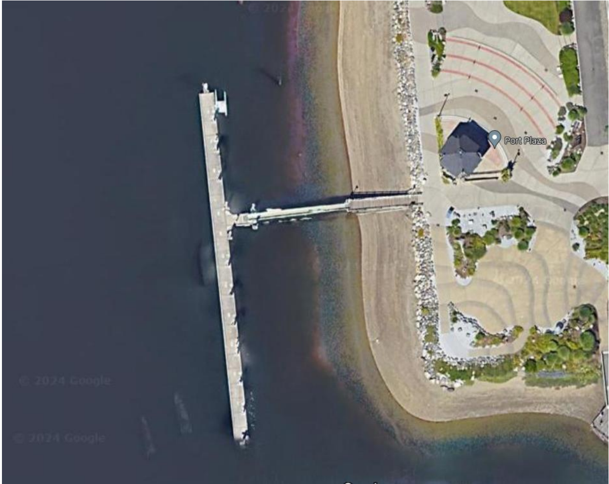
Port Plaza 724 Columbia St NW, Olympia, WA 98501